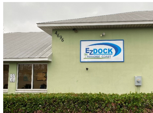
EZ Docks Paradise Coast 4696 Elevation Way, Fort Myers, Florida 33905

Come visit our newest location, EZ Docks Paradise Coast at 4696 Elevation Way, Fort Myers, Florida or give us a call at (941) 217-8841.