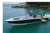
39' Solarium 390 $699,000