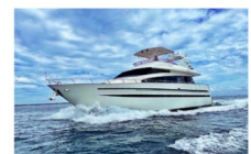
72' Azimut - 65 Pininfarina $439,999

Come see us at 837 5th Ave South | evyachtsales.com | 239-404-9329