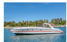
50' Harley Offshore 48 $124,000