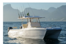
28' Garnet Offshore 300HT $349,000