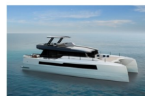
63' McConaghy 63P Tourer $3,823,000