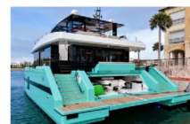
68' Sunreef - Power Cat $4,500,000