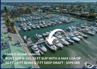
MARCO ISLAND MARINA BOAT SLIP B-101, 50 FT SLIP WITH A MAX LOA OF 55 FT, 18 FT BEAM & 7 FT DEEP DRAFT - $399,000