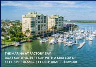
THE MARINA AT FACTORY BAY BOAT SLIP A-16, 44 FT SLIP WITH A MAX LOA OF 47 FT, 19 FT BEAM & 7 FT DEEP DRAFT - $229,000