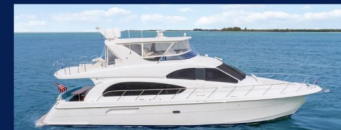
2005 64 HATTERAS