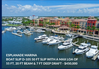
ESPLANADE MARINA BOAT SLIP D-105 50 FT SLIP WITH A MAX LOA OF 55 FT, 20 FT BEAM & 7 FT DEEP DRAFT - $450,000