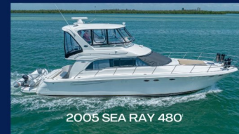
2005 SEA RAY 480

SYCYACHTS.COM 800.266.4432 INFO@SYCYACHTS.COM