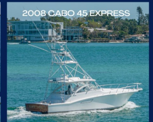
2008 CABO 45 EXPRESS