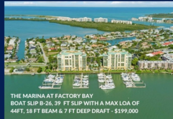
THE MARINA AT FACTORY BAY BOAT SLIP B-26, 39 FT SLIP WITH A MAX LOA OF 44 FT, 18 FT BEAM & 7 FT DEEP DRAFT - $199,000