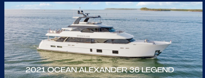
2021 OCEAN ALEXANDER 36 LEGEND