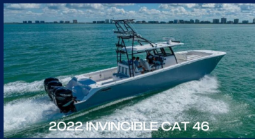
2022 INVINCIBLE CAT 46