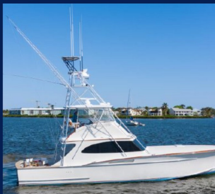
1993 RYBOVICH 54