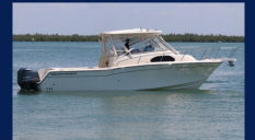
2021 GRADY WHITE MARLIN 300