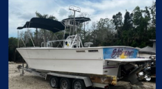
2000 PREMIUM PARASAIL BOAT 28