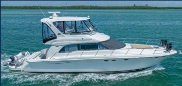
2003 SEA RAY 480