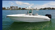
2012 BW 280 OUTRAGE