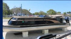
2017 BENNINGTON 30QSR