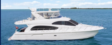
2005 64 HATTERAS