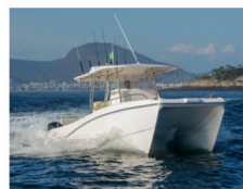
28ft 2023 Garnet Offshore - 300HT PRICE $345,000 With 20 rod holders, double 300 Mercury outboards, she can go to 40 knots. The deck has a livewell and lockers yet still has plenty of room for seating. Great cruiser to dock anywhere. Brazilian built with the highest of quality craftsmanship and priced competitively. Garnet 300HT does well through big chop waters. Easy to show and priced to move! Pristine condition, never used.