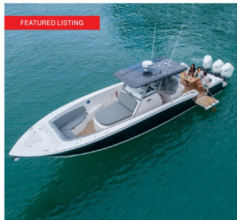
Fishing Raptor - 390 Solarium PRICE $595,000

BOATS DOCKED AT: The Cove Inn on Naples Bay - 900 Broad Avenue South Naples, Florida 34102