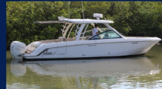
2017 BW 320 VANTAGE