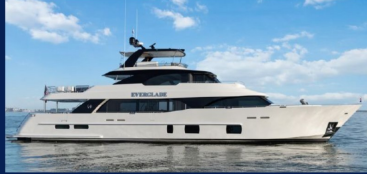
2021 OCEAN ALEXANDER 36 LEGEND