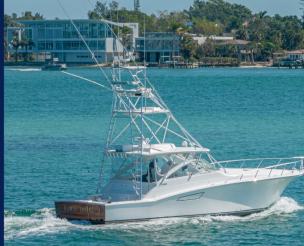
2008 CABO 45 EXPRESS