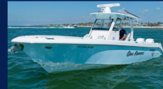
2017 EVERGLADES 325