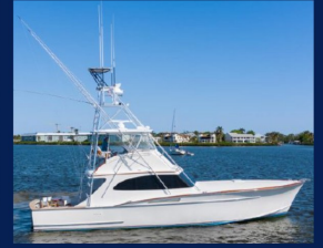
1993 RYBOVICH 54