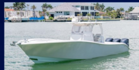
2014 YELLOWFIN 36