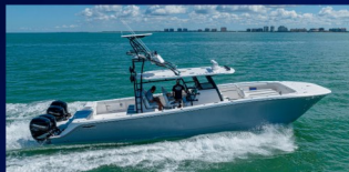
2022 INVINCIBLE 46 CATAMARAN