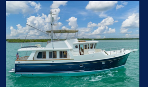
2001 SELINE 50 OCEAN TRAWLER