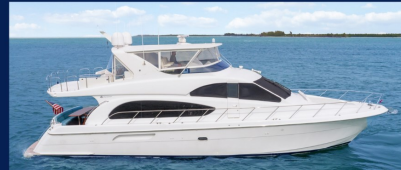
2005 64' HATTERAS