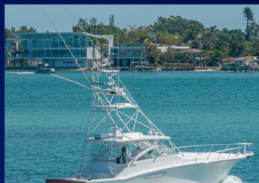
2008 CABO 45 EXPRESS