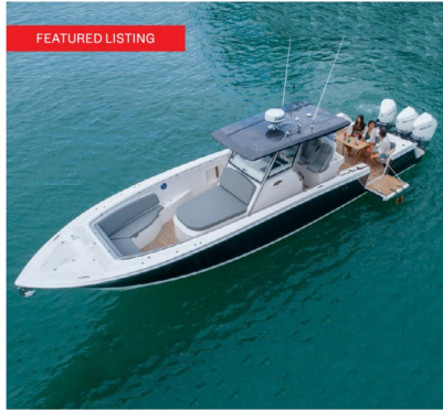
Fishing Raptor - 390 Solarium PRICE $595,000

BOATS DOCKED AT: The Cove Inn on Naples Bay - 900 Broad Avenue South Naples, Florida 34102