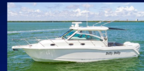
2018 BW 345 CONQUEST