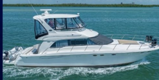
2003 SEA RAY 480 SEDAN BRIDGE