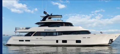
2021 OCEAN ALEXANDER 36 LEGEND