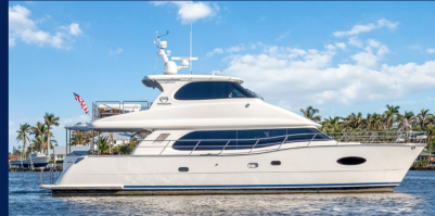
2021 HORIZON PC 60