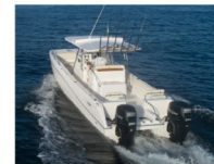
28ft 2023 Garnet Offshore - 300HT PRICE $345,000

With 20 rod holders, double 300 Mercury outboards, she can go to 40 knots. The deck has a livewell and lockers yet still has plenty of room for seating. Great cruiser to dock anywhere. Brazilian built with the highest of quality craftsmanship and priced competitively. Garnet 300HT does well through big chop waters. Easy to show and priced to move! Pristine condition, never used.