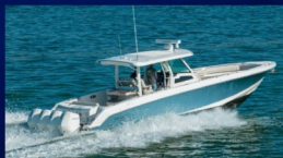
2021 BW 380 OUTRAGE