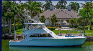
1990 BUDDY DAVIS 61 CONVERTIBLE