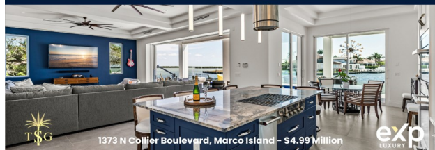
1373 N Collier Boulevard, Marco Island - $4.99 Million