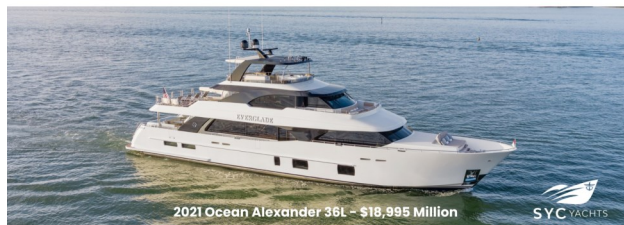
2021 Ocean Alexander 36L - $18,995 Million