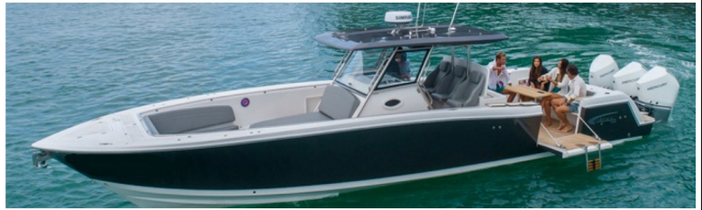
39ft 2023 Fishing Raptor - Solarium 390 PRICE $625,000