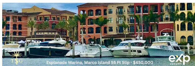
Esplanade Marina, Marco Island 55 Ft Slip - $450,000