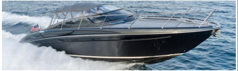
44ft 2016 Riva Rivarama 44 Super PRICE $695,000