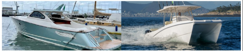
37ft 2023 Gagliotta - Lobster 35 PRICE $729,500