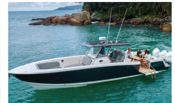
39ft 2023 Fishing Raptor