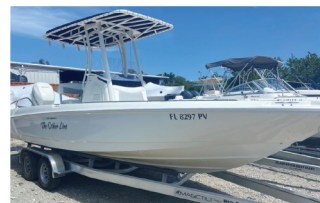
24ft 2015 Boston Whaler