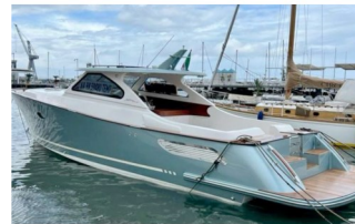
37ft 2023 Performance Cruiser