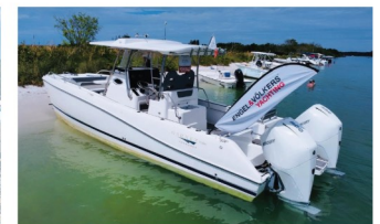
28ft 2023 Power Catamaran