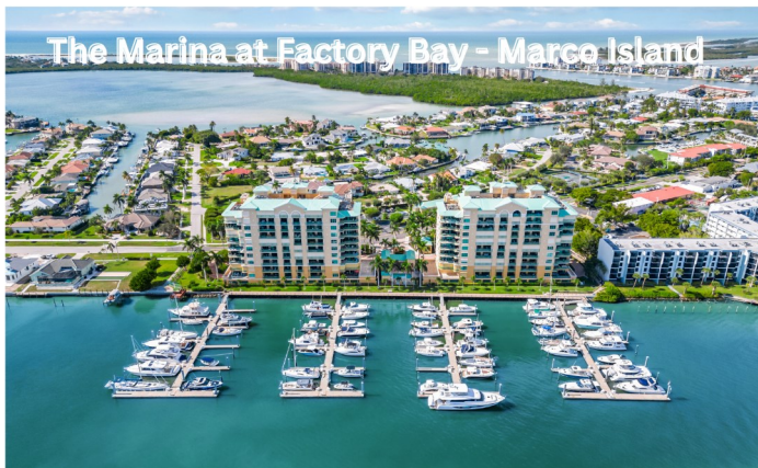
The Marina at Factory Bay - Marco Island