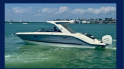
2017 SEA RAY 31 SLX