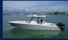
2017 JUPITER 34 CC