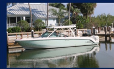
2016 BOSTON WHALER 320 VANTAGE