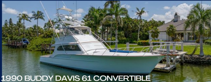
1990 BUDDY DAVIS 61 CONVERTIBLE