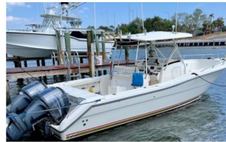
33ft 2003 Pursuit PRICE: NOW $89,900