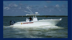
2015 YELLOWFIN 32