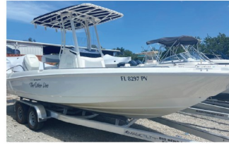
24ft 2015 Boston Whaler PRICE: NOW $75,000