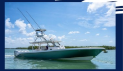
2019 EVERGLADES 435 CC