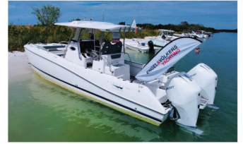
28ft 2023 Power Catamaran PRICE: NOW $299,000