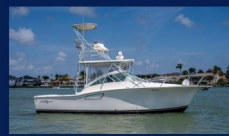
2004 ALBEMARLE 310 EXPRESS