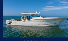
2018 SCOUT 42