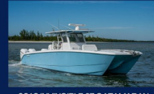
2019 INVINCIBLE 37 CATAMARAN