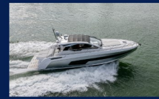
2022 AZIMUT 45 ATLANTIS