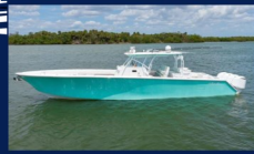
2017 SEAHUNTER 45 TOURNAMENT