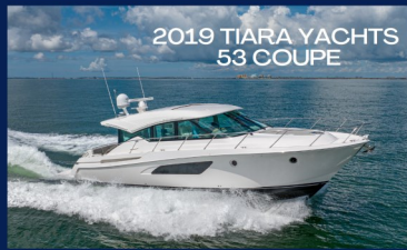
2019 TIARA YACHTS 53 COUPE