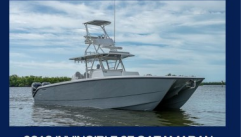
2019 INVINCIBLE 37 CATAMARAN