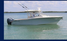
2022 GRADY-WHITE FREEDOM 335