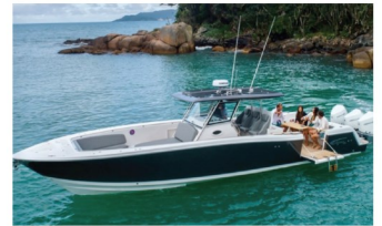
39ft 2023 Fishing Raptor PRICE: NOW $575,000