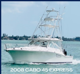
2008 CABO 45 EXPRESS

SYCYACHTS.COM 800.266.4432 INFO@SYCYACHTS.COM