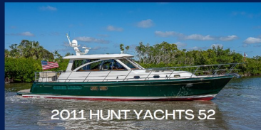
2011 HUNT YACHTS 52