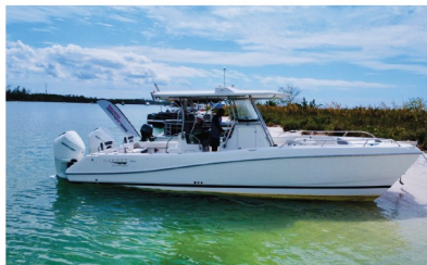
2023 Power Catamaran 30' | New Price: $249,000