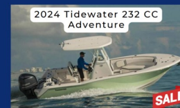
2024 Tidewater 232 CC Adventure

Call Us Today! 800.266.4432 or Visit Us Online at sycyachts.com