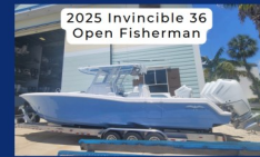
2025 Invincible 36 Open Fisherman

Yacht Sales - Brokerage - New Construction