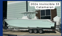
2024 Invincible 33 Catamaran

Call Us Today! 800.266.4432 or Visit Us Online at sycyachts.com