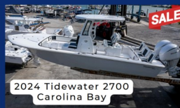
2024 Tidewater 2700 Carolina Bay

Yacht Sales - Brokerage - New Construction