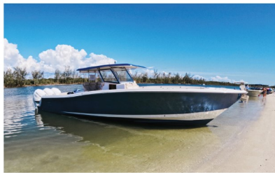
2023 Fishing Raptor 39' | New Price: $559,000