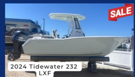
2024 Tidewater 232 LXF