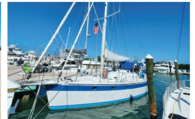
45ft 2007 Bruce Roberts $199,000