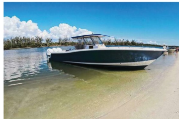
39ft Center Console NOW $525,000