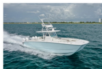
37' Catamaran Arriving OCT