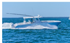
40' Catamaran On Order