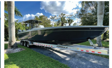
38ft 1996 Formula NOW $249,900