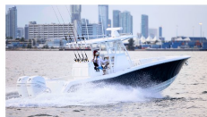
33' Open Fisherman On Order