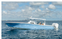
43' Open Fisherman