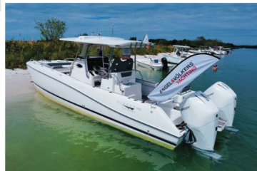
30ft 2023 Power Catamaran NOW $225,000