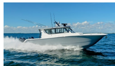
46' Pilothouse On Order