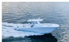
33' Catamaran DEMO Available JAN 2025