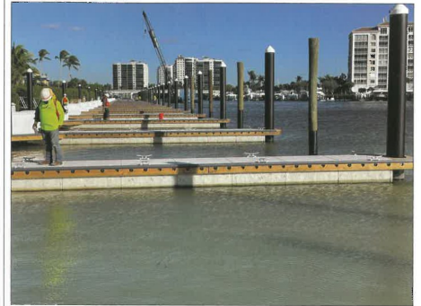
Pelican Isle Yacht Club in Naples, Florida, replaced 190 slips after the facility was destroyed during Hurricane Ian in 2022.